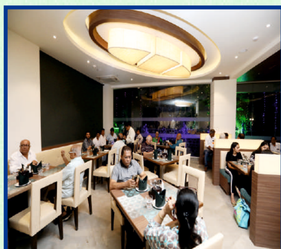
PURE VEG. RESTAURANT