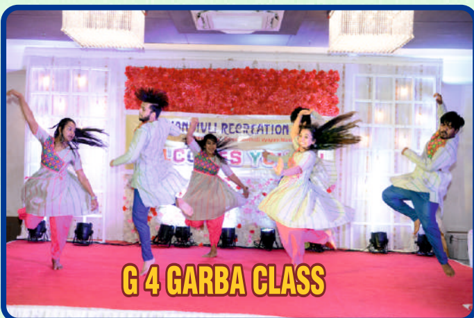
G 4 GARBA CLASS