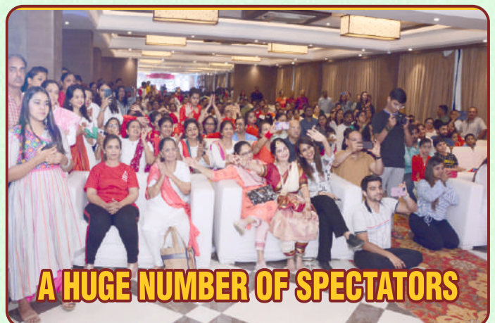
A HUGE NUMBER OF SPECTATORS